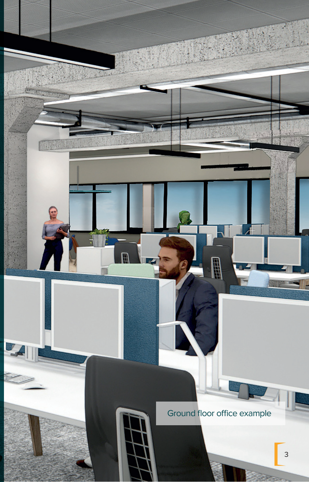
Ground floor office example